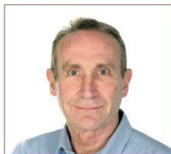
Graham Young Secondary School Visual Arts Teacher