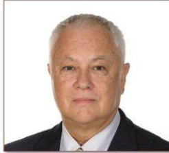
Kevin Smith Elementary School Principal and EAL Teacher