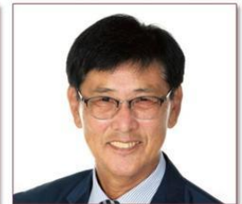
ChanGi Jin Bus Driver