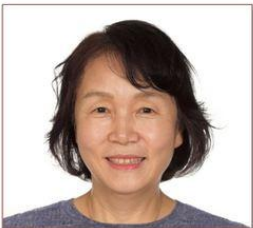
MiAe Park Bus Monitor