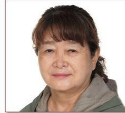
OkRan Song Bus Monitor