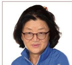
HongLim An Cafeteria Staff