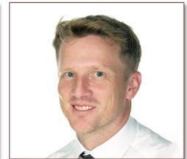
Ben Ashley Elementary School Teacher