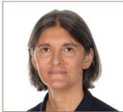
Kate Rock Elementary School Teacher