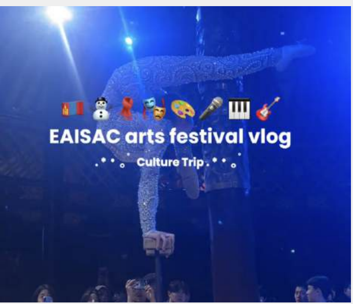
Click the image for Namuun's Travel Vlog